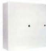
PS-C16 1.2 Amp Power Supply