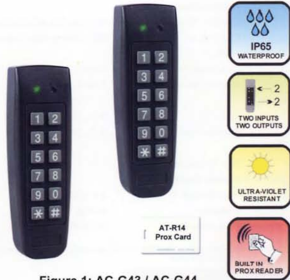
Figure 1: AC-G43 / AC-G44