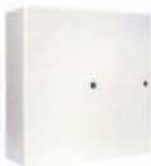
PS-C17 2 Amp Power Supply